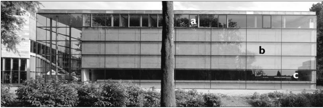
Figure 1 The new north wing of the Natuurmuseum Rotterdam. a = the office of the author; b = the approximate location where NMR 9997-00232 hit the glass façade; c = the site from where the author observed the rape (from behind the glass).

not fly away but simply walked off a few metres, weakly uttering series of two-note 'raeb-raeb' calls (the 'conversation-call' of Lorentz 1953). I secured the dead duck and left the museum at 19.25 h. The mallard was still present at the site, calling 'raeb-raeb' and apparently looking for his victim (who, by then, was in the freezer).