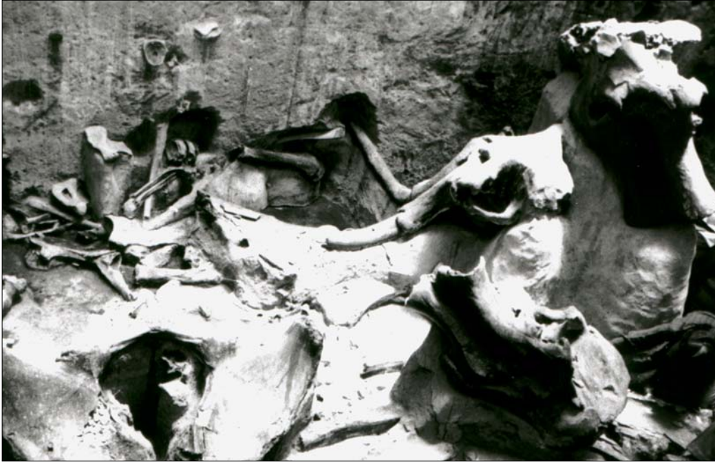
Figure 2 Photograph of the Mammuthus columbi remains at Tocuila.

However, recent studies (Gonzalez et al. 2001) indicate that the lahar deposit is associated with the upper Toluca Pumice (UTP) about 10,500 yBP.