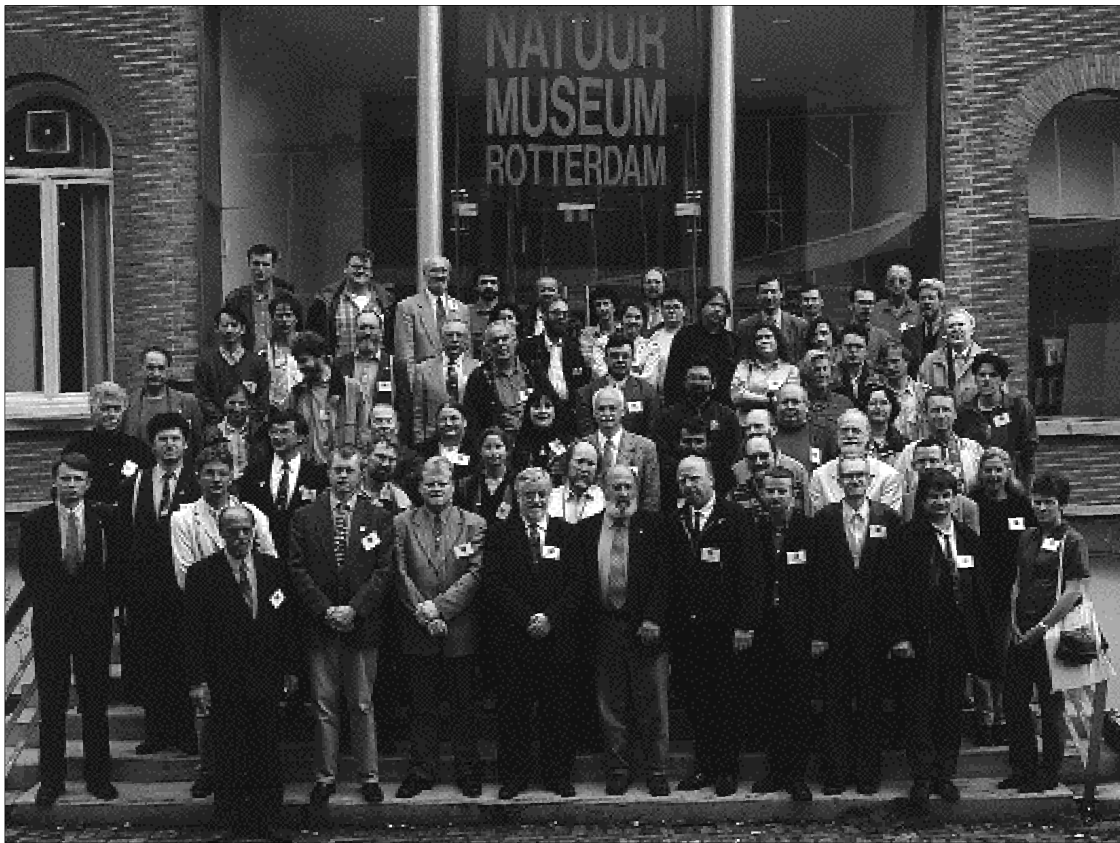
The majority of participants in front of the Natural History Museum Rotterdam, 20 May 1999. [photo and illustration: Jaap van Leeuwen]