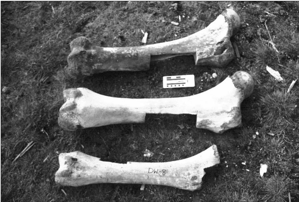
Figure 2. Femurs of the Holocene mammoths from Wrangel Island.

Among other bones we can compare some bones of the extremities. The collection of Holocene bone remains from Wrangel includes three femurs (Fig. 2) and one tibia. All other bones are of unknown age. Among them a whole pelvis, its width, 1300 mm. The sizes of American mammoths are appreciably less; the width of pelvis varies from 540 to 942 mm. Three Holocene Wrangel femurs have lengths of 836 mm (subadult specimen with unfused epiphyses), 985, and 1010 mm. Mammoths from the Channel Islands had smaller femurs, varying from 590 to 842 mm (n=14). The length of the tibia with fused epiphyses from Wrangel Island ranges from 431 to 519 mm (n=5). Tibia sizes from the Channel Islands did not exceed 505 mm (n=1), though the majority were between 300 and 400 mm (n=11); there were 4 bones ranging between 400 and 500 mm.