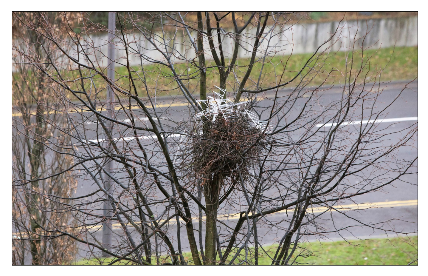
Figure 6 Magpie nest in Partick, Glasgow, Scotland, with bird spikes especially placed on top of the nest; 13 December 2021.