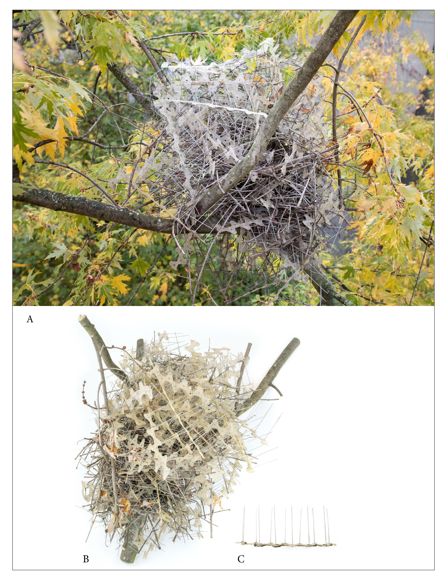
Figure 4 A The Antwerp magpie nest constructed with anti-bird spikes, seen on the fork of a branch in a sugar maple tree on 25 October 2021. B The collected nest as part of the Naturalis collection; RMNH.AVES.259588. C A similar looking single strip of bird spikes, collected from the roof of the Academic Hospital Antwerp (UZA). [Auke-Florian Hiemstra]