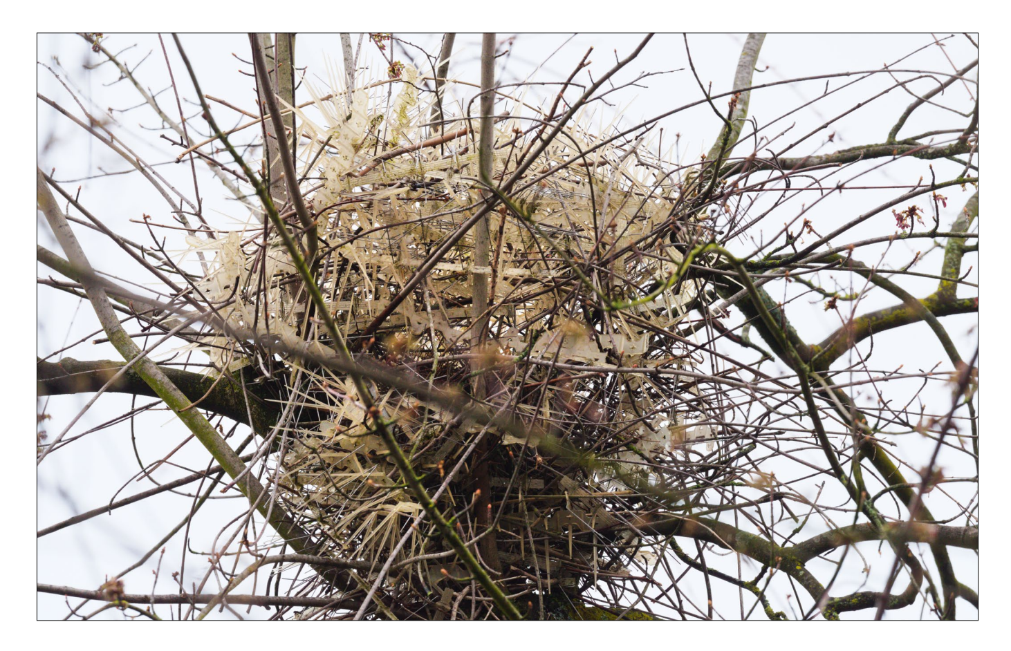
Figure 5 Magpie nest constructed with anti-bird spikes in Enschede, The Netherlands, located in an ornamental plum (Prunus sp.) tree; 12 April 2023. [Wijnand Koekoek]