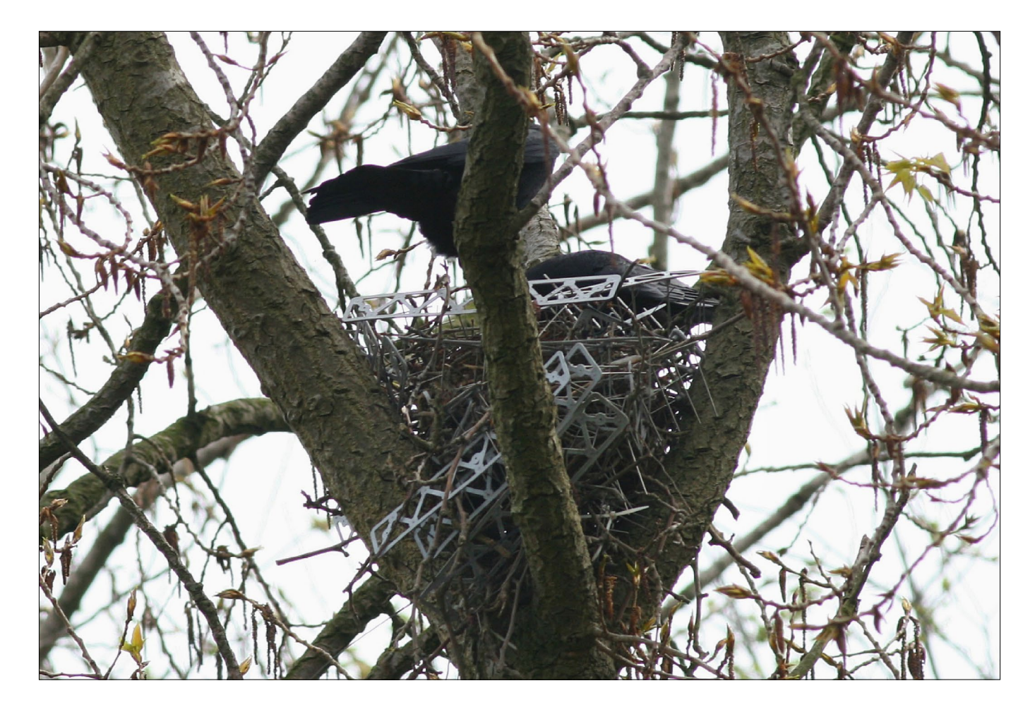
Figure 1 Carrion crows (Corvus corone) on their nest, partly made of anti-bird spikes, in a poplar (Populus sp.) tree; Rotterdam, The Netherlands; 7 April 2009.

Some birds go even a step further, and tear bird spikes off buildings themselves. Corellas Licmetis sp. removed spikes from the St Francis Xavier Cathedral in Geraldton, Australia (O'Connor 2019). Isaac Sherring-Tito captured similar behaviour on video in Katoomba in the Blue Mountains west of Sydney, where a sulphur-crested cockatoo Cacatua galerita Latham, 1790 removed bird spikes from the Town Centre Arcade in 2019 (Taylor 2019). The video, originally posted on Facebook, can now be seen on YouTube (ViralHog 2019), where also an earlier observation from 2013 can be found, of a cockatoo ripping anti-bird spikes off a roof (Blow 2013). While these observations are not directly connected to nest building, they do show that members of some bird families are